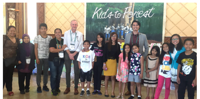
Representatives from the 'Kids to Forest Programme'.