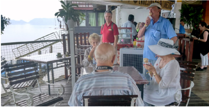
The new attraction in OUI – The Lakeside Café. Tarikan baru di OUI- Lakeside Café.

Tarikan terbaru di Pulau Orang Utan, Lakeside Café telah mula beroperasi mulai pertengahan bulan Mac lalu. Pelbagai hidangan ditawarkan di situ, termasuklah buah-buahan segar, roti, makanan ringan, serta air kelapa dan aiskrim untuk melegakan tekak di hari yang panas.