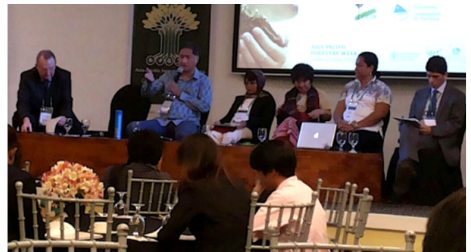
One of the dialogue session.

These five thematic streams were continued in parallel sessions throughout the event. During the 5 day event, several exhibition booths showcased their eco-friendly forest products and activities. One of the exhibitors were the 'Kids to Forest Programme', which similar to the Green Ranger Malaysia, encourage children to appreciate forest and environment.