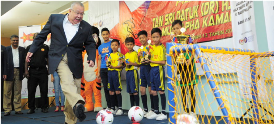
Majlis pelancaran Liga TSMK.