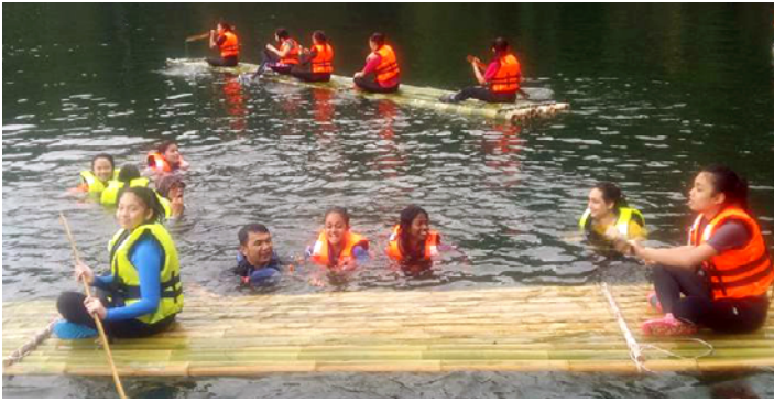
Water confidence activity in the lake. Aktiviti dalam tasik untuk membina keyakinan di dalam air.