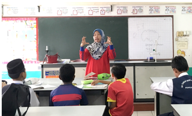
Sesi kelas tuisyen di SK Taman Seri Gombak.

Selamat Maju Jaya diucapkan kepada para pelajar dan guru-guru!