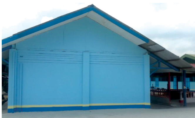
Back of TSMK's Standard 1 classroom after repair.