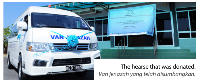
The hearse that was donated. Van jenazah yang telah disumbangkan.

Sebelum kem ini melabuhkan tirainya, peserta program menerima hadiah masing-masing hasil dari kejayaan mereka dalam sesi permainan dan kuiz yang dijalankan sepanjang kem 3 hari 2 malam ini.