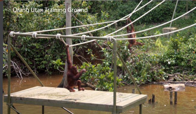
Orang Utan Training Ground