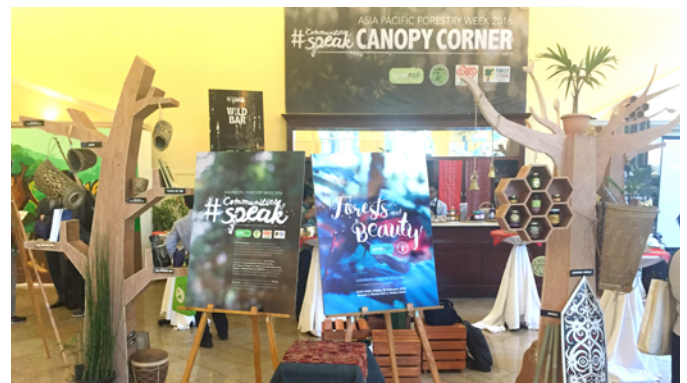
Some of the handicrafts displayed at the event.