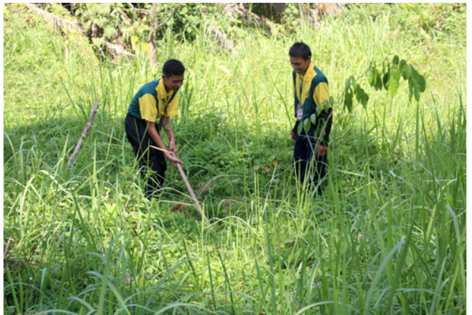
Planting of trees at Orang Utan Island. Penanaman pokok di Pulau Orang Utan.