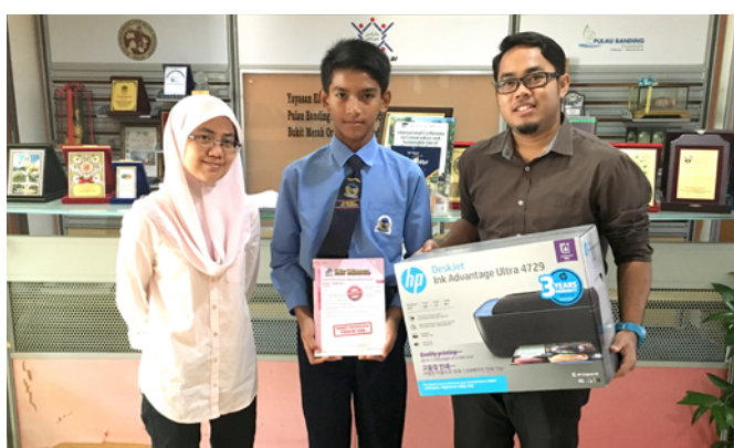
Penyerahan alat-alat bantuan mengajar kepada SK Seksyen 11 Kota Damansara.