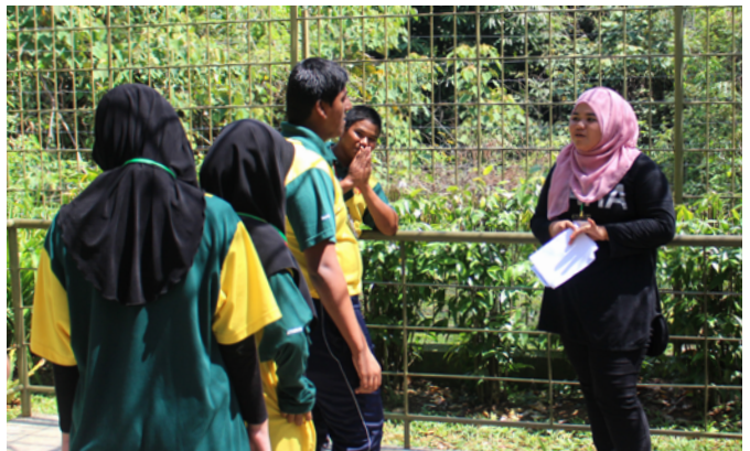
Student participating in the quiz programme during the Orang Utan Island Educational Program. Para pelajar mengambil bahagian dalam kuiz semasa program.