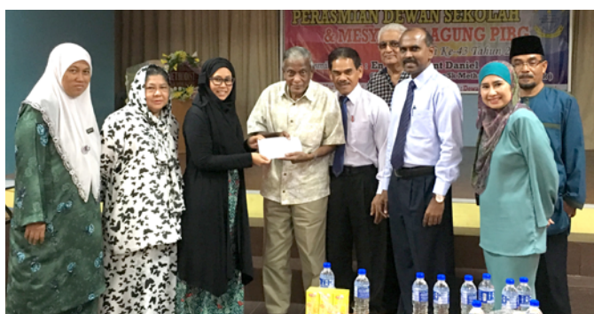
Cheque presentation to SK Methodist Banting.