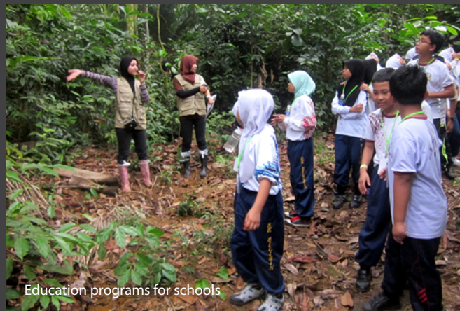
Education programs for schools