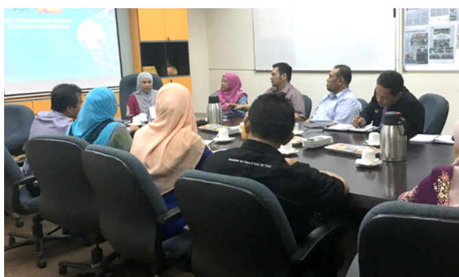
Sesi penerangan imbuhan Piala Tan Sri Datuk (Dr.) Hj. Mustapha Kamal.