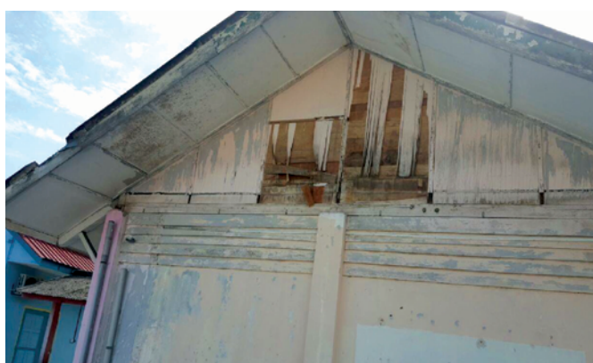
Back of TSMK's Standard 1 classroom before repair.