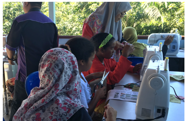
The sewing workshop session at Kg Desa Damai. Sesi bengkel jahitan di Kg Desa Damai.