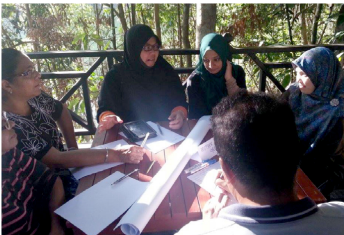
Group discussion at Belum Adventure Camp. Sesi perbincangan dalam kumpulan di Belum Adventure Camp.