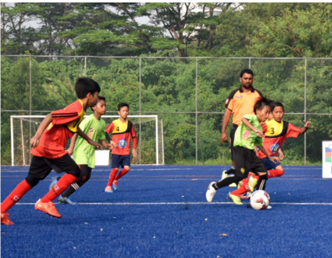
Para pemain beraksi semasa perlawanan.

Istimewanya pertandingan ini adalah pada aspek jenis imbuhan kepada pasukan-pasukan yang menang, di mana empat pasukan yang menang di dalam pertandingan ini telah mendapat kelas bimbingan tuisyen percuma. Kelas bimbingan tuisyen ini akan diadakan di sekolah masing-masing dan diuruskan melalui PIBG sekolah tersebut. Satu kem intensif akan turut diadakan di Kolej Perkembangan Awal Kanak-Kanak, Kampus Damansara Damai, dengan tujuan khusus untuk membina keyakinan para pelajar dan sebagai sebahagian daripada persediaan akhir untuk menghadapi peperiksaan UPSR pada bulan September 2016.