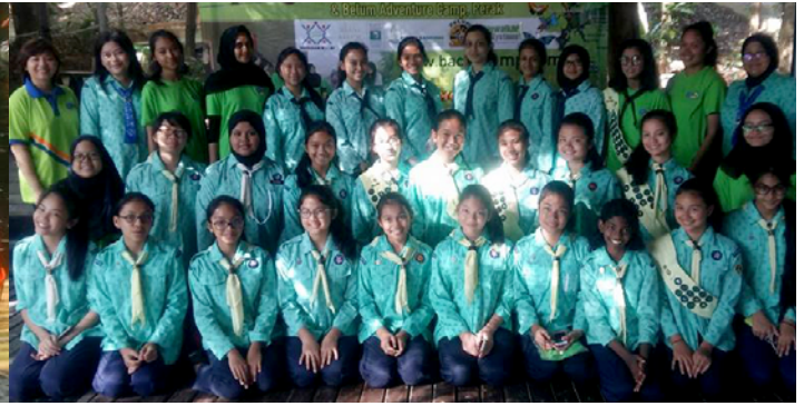
The participants in their Girl Guides' uniform. Para peserta berpakaian seragam Pandu puteri.