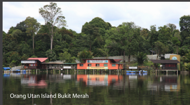
Orang Utan Island Bukit Merah