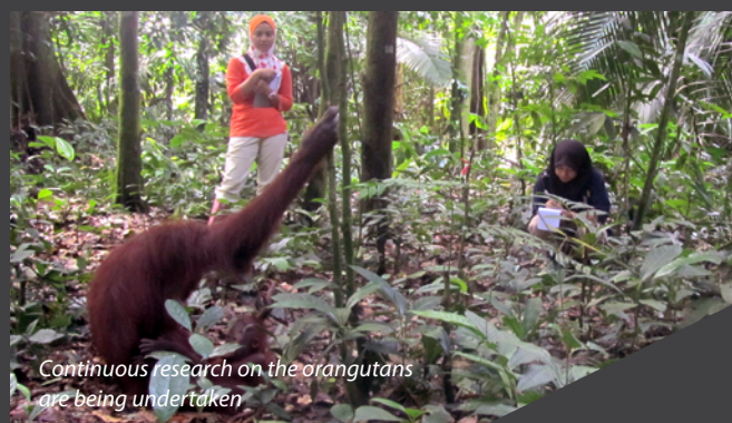
Continuous research on the orangutans are being undertaken