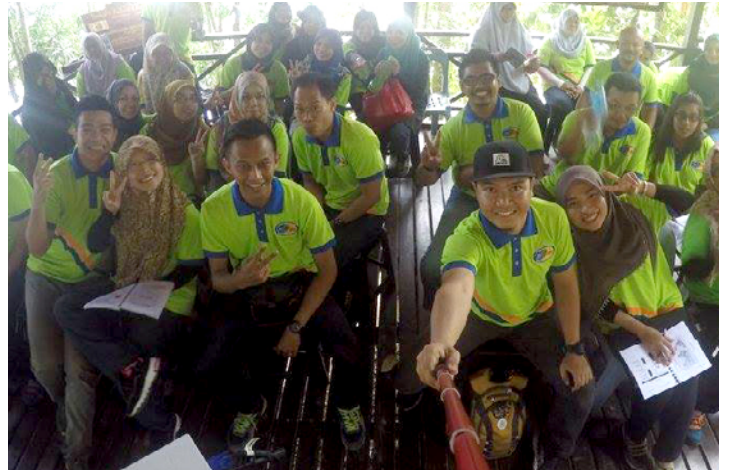
Thank you Volunteers! Terima kasih Sukarelawan Yayasan EMKAY!