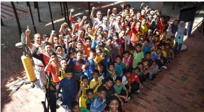
Kem Intensif & Motivasi UPSR di Selangor.