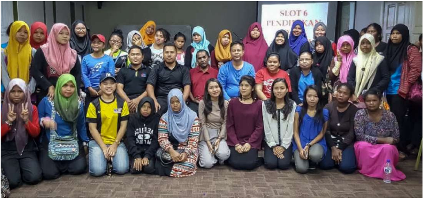
Sesi foto berkumpul di akhir sesi slot motivasi dan refleksi.