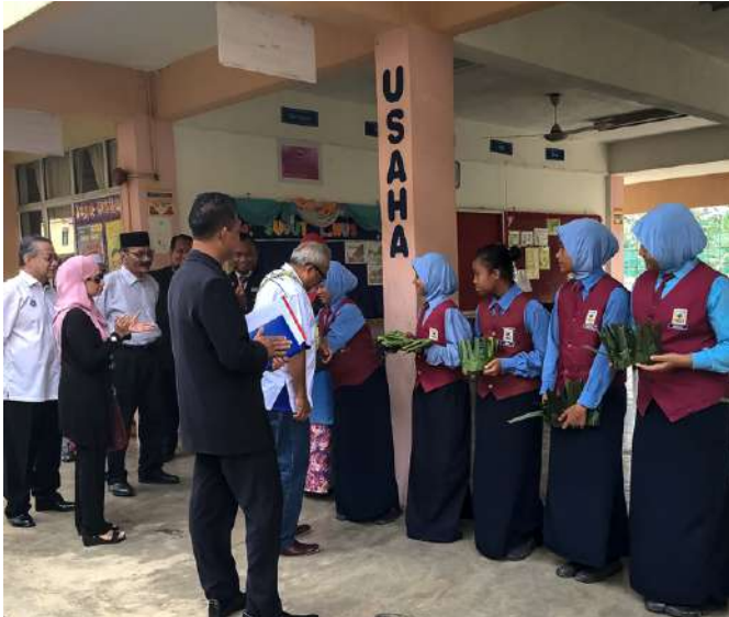
Wakil pelajar SK Penderas memakaikan anyaman daun pada tetamu jemputan pada sesi lawatan dan penerangan program pada 10 Oktober 2017.