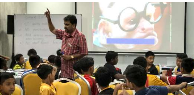
Kem Intensif & Motivasi UPSR di Selangor.