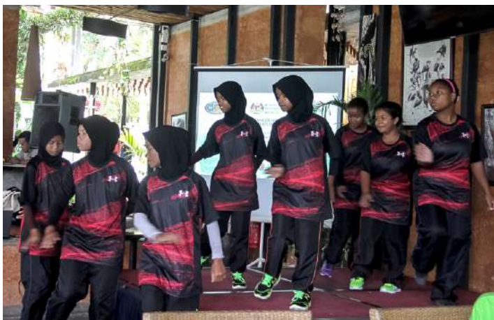
Guests, teachers and participants were entertained by the Zumba Girls Group. Tetamu jemputan, guru dan para peserta KITE dihiburkan dengan persembahan oleh Zumba Girls.