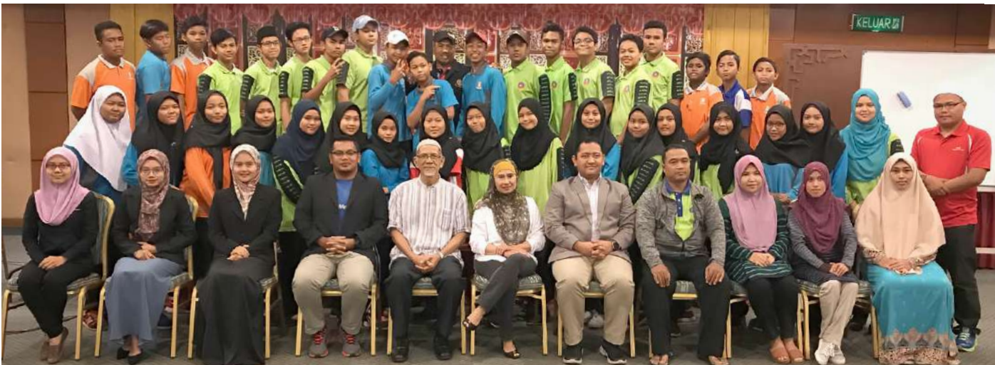
The participants, Smart Management Enterprise team, Al-Hunafa secretariat and representatives from Yayasan EMKAY. Sesi foto berkumpul bersama pasukan Smart Management Enterprise, sekretariat Persatuan Al-Hunafa dan wakil Yayasan EMKAY.