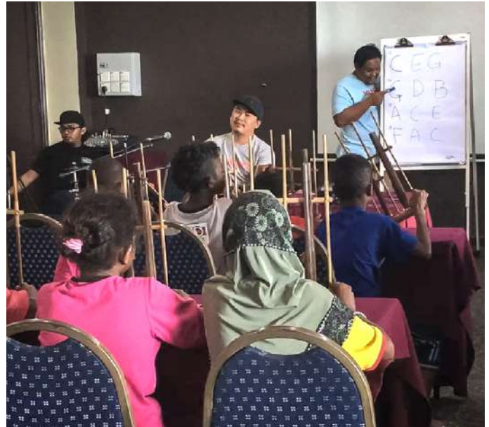
"I know my alphabets!" "Saya kenal huruf!"