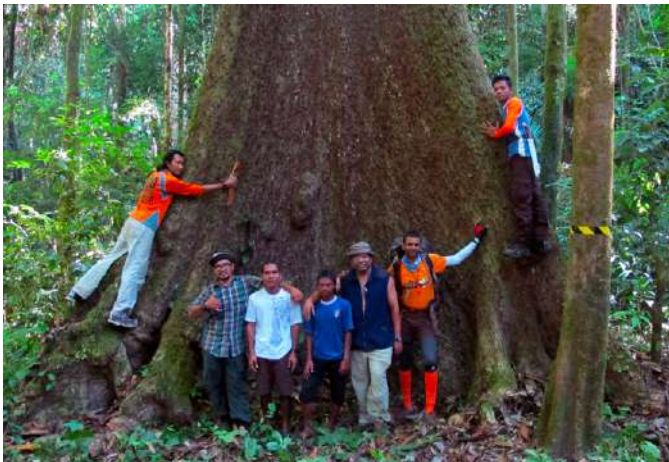
The Belum-Temengor Scientific Expedition.