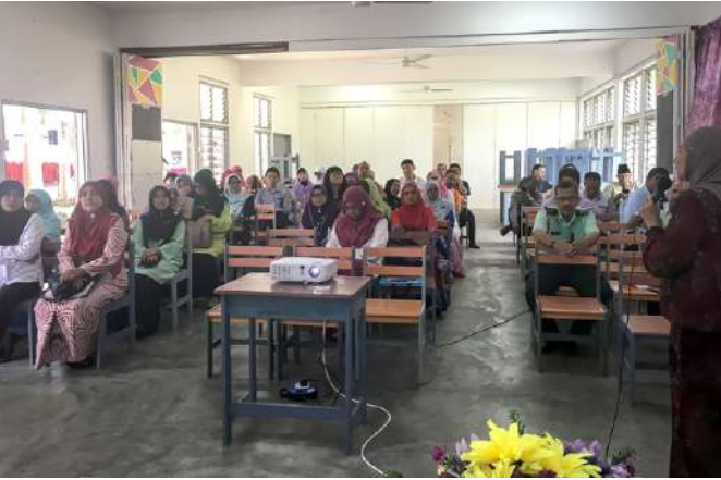
Sesi taklimat program dan aktiviti Green Ranger Malaysia di SMK Seri Budiman.