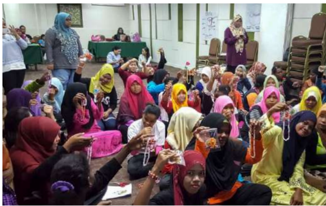
Para peserta memperlihatkan hasil kerja tangan seperti gelang, rantai dan rantai kunci dari manik.