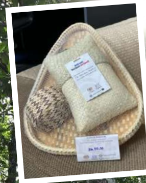
Individual Gift Package

Thank you for your interest and participation!