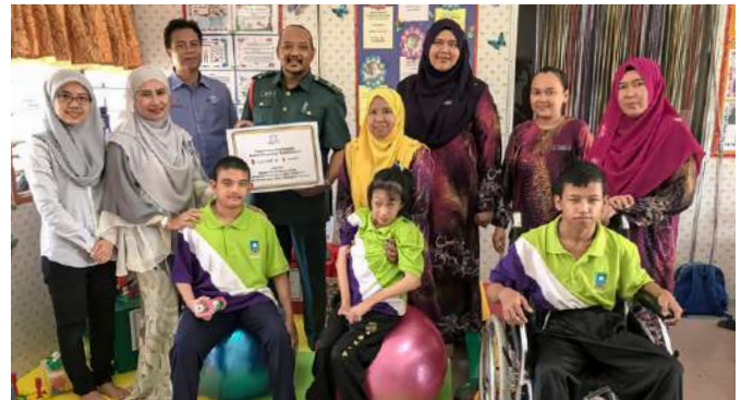
Penyerahan kotak permainan kepada PKPI SMK Pengkalan Aur.