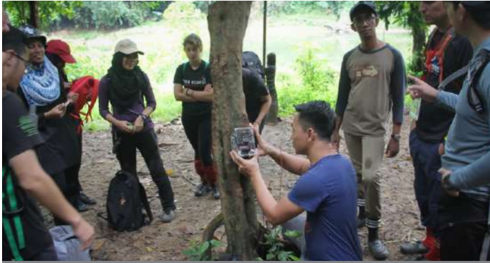
Demonstration of camera traps. Demonstrasi pemasangan kamera perangkap.