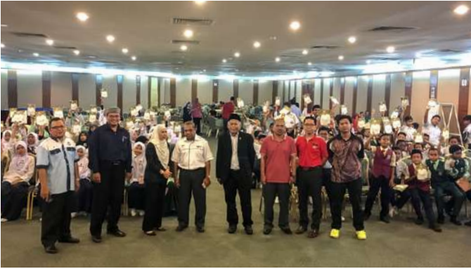
Kem Gempur Gemilang di Bukit Merah Laketown Resort, Perak.