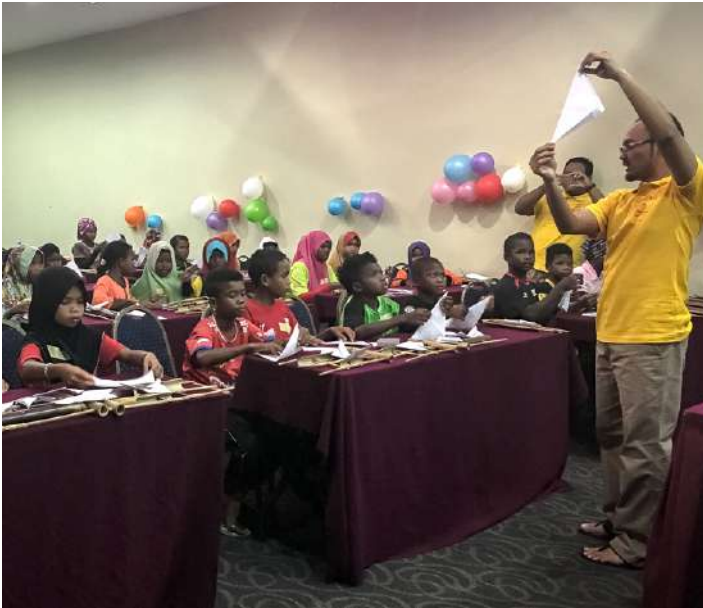
Motivational session through origami. Sesi motivasi melalui aktiviti origami.