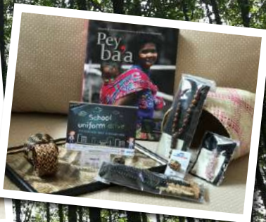
Corporate Gift Package