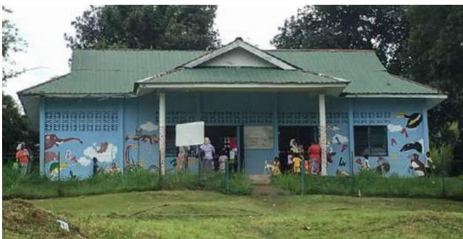
Gambaran terkini bahagian luar bangunan Perpustakaan Permainan 'i-play' di Kampung Sungai Tiang, Royal Belum, Perak.