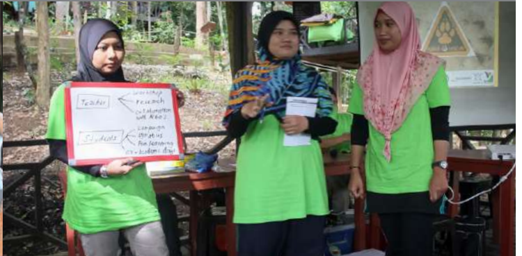
Participants presenting their ideas on how to spread awareness on tigers. Para peserta membentangkan cara menyebarkan kesedaran tentang harimau.