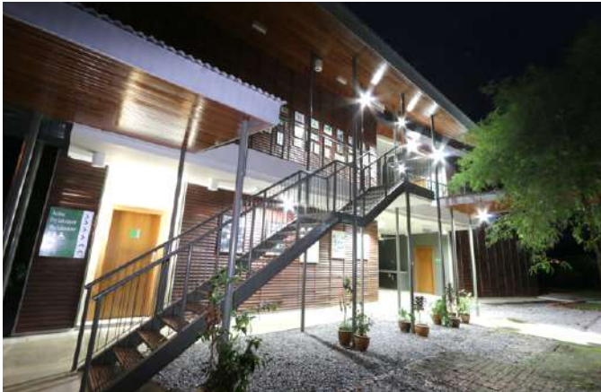
Pulau Banding Rainforest Research Centre (PBRRC).