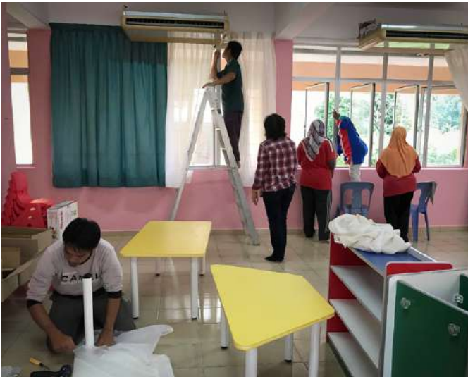
Sesi gotong royong di PPip dengan bantuan guru-guru dan petugas SK Penderas serta sukarelawan Yayasan EMKAY.