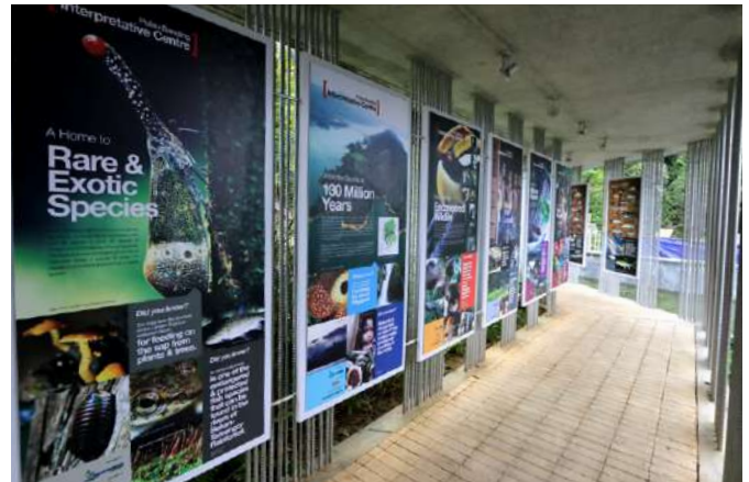
Belum Discovery Centre (BDC).