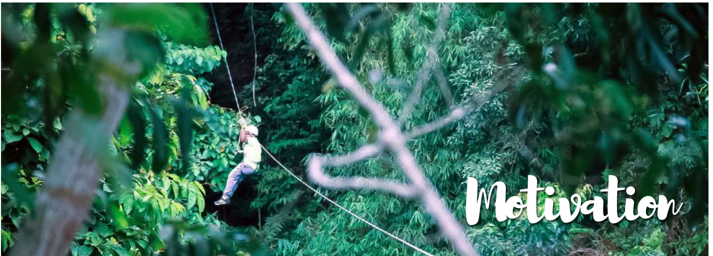
Participants taking part in the Zipmania High Rope Course. Para peserta melalui cabaran tali yang diberi nama Zipmania.