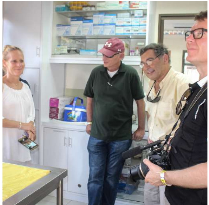
Briefing the delegates on conservation efforts during the island tour.

25 students of the Villa High School of Maldives took part in this workshop which was held on the 25th July 2017. It is hoped that the students benefit from the workshop and share the knowledge imparted to them by the foundation with their counterparts.