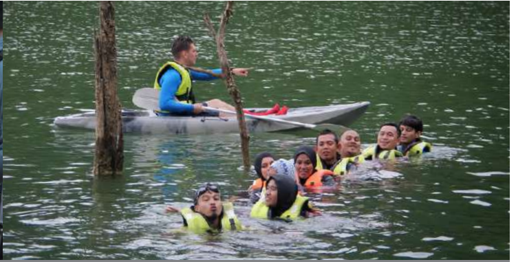
Water confidence activity is part of the camp module to help participants to get over the fear of water. Aktiviti keyakinan dalam air turut dijalankan sebagai sebahagian dari modul kem supaya peserta dapat mengatasi rasa takut berada di dalam air.