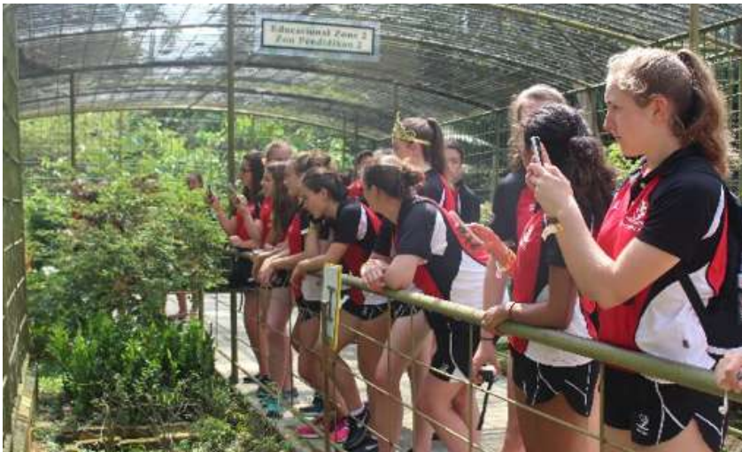
(ABOVE) Students were briefed on the Orang Utan Island Foundation activities, though their eyes are already on the orangutan.