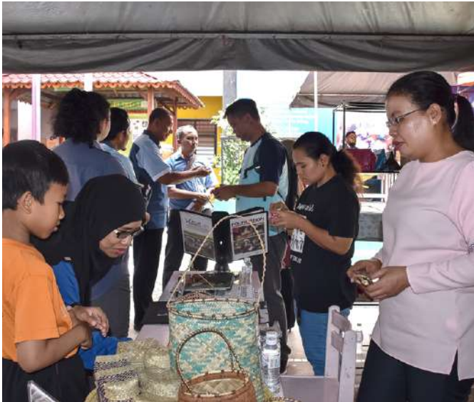
We hope that the people who visited our booth gained some insights to what we do.