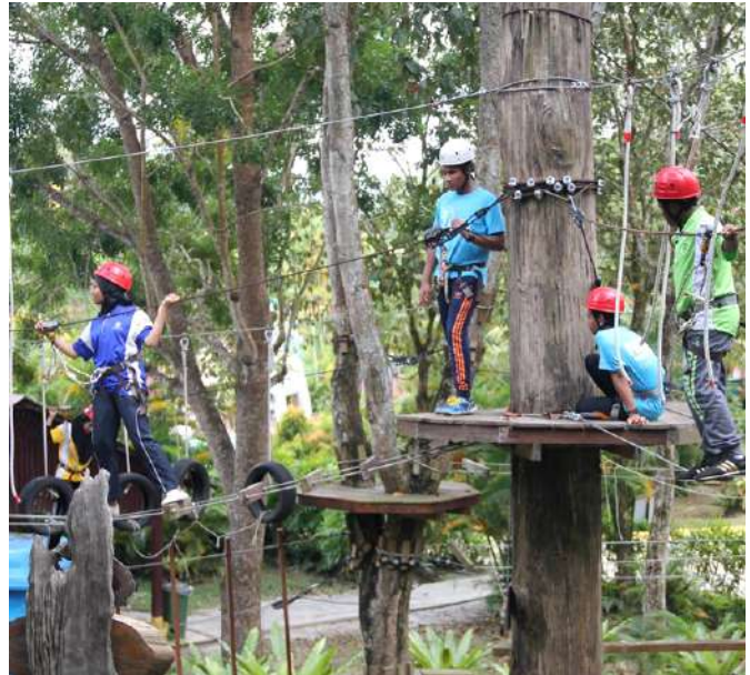
Participants taking part in the Kids & Practice Course, Laketown Adventure Park. Para peserta melalui cabaran tali di Kids & Practice Course, Laketown Adventure Park.