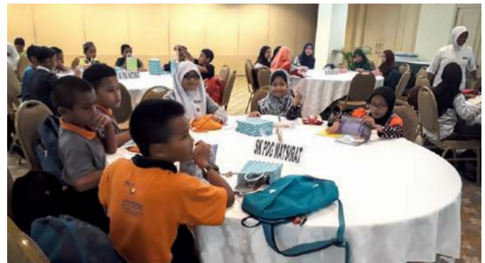
Program Pecut UPSR di Ombak Villa, Langkawi.