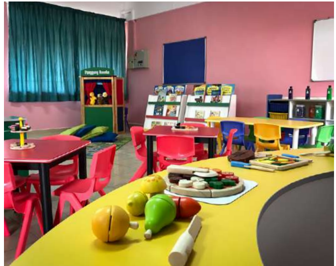
Bahagian PPip yang telah siap dibangunkan dan sedia menerima kunjungan murid-murid SK Penderas.