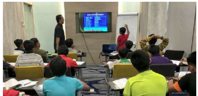
Kem Intensif & Motivasi UPSR di Selangor.

Sesi seumpamanya turut dijalankan Ombak Villa, Langkawi pada 14 hingga 15 Julai 2017 melibatkan 40 orang pelajar tahun 6 dari Sekolah Kebangsaan Ulu Melaka dan Sekolah Kebangsaan Padang Matsirat.