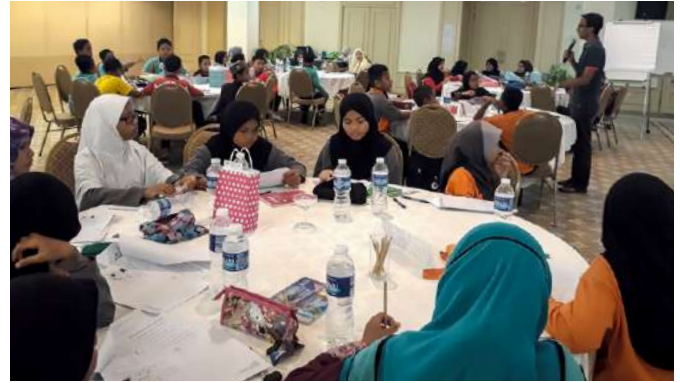
Program Pecut UPSR di Ombak Villa, Langkawi.

Majlis Penutupan dan Penyampaian Sijil Penyertaan yang berlangsung di Menara Mustapha Kamal telah disempurnakan oleh Encik Zaid bin Zakaria, Ketua Penolong Pengarah Bahagian Sukan, Kementerian Pendidikan Malaysia. Encik Zaid dalam ucapannya menyatakan syabas dan terima kasih kepada pihak Yayasan EMKAY atas penganjuran Liga dan imbuhan liga yang terarah kepada pendidikan serta selaras dengan matlamat Kementerian Pendidikan agar menghasilkan murid yang mencapai keseimbangan dalam kedua-dua bidang iaitu cemerlang dalam bidang akademik dan sukan.