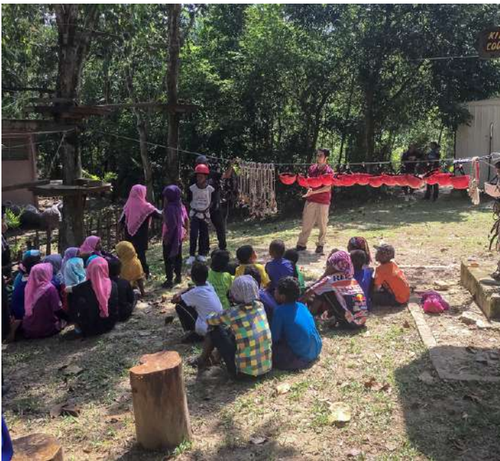
Safety briefing before the Kids & Practice Course activities. Sesi taklimat keselamatan sebelum menjalankan aktiviti di Kids & Practice Course.