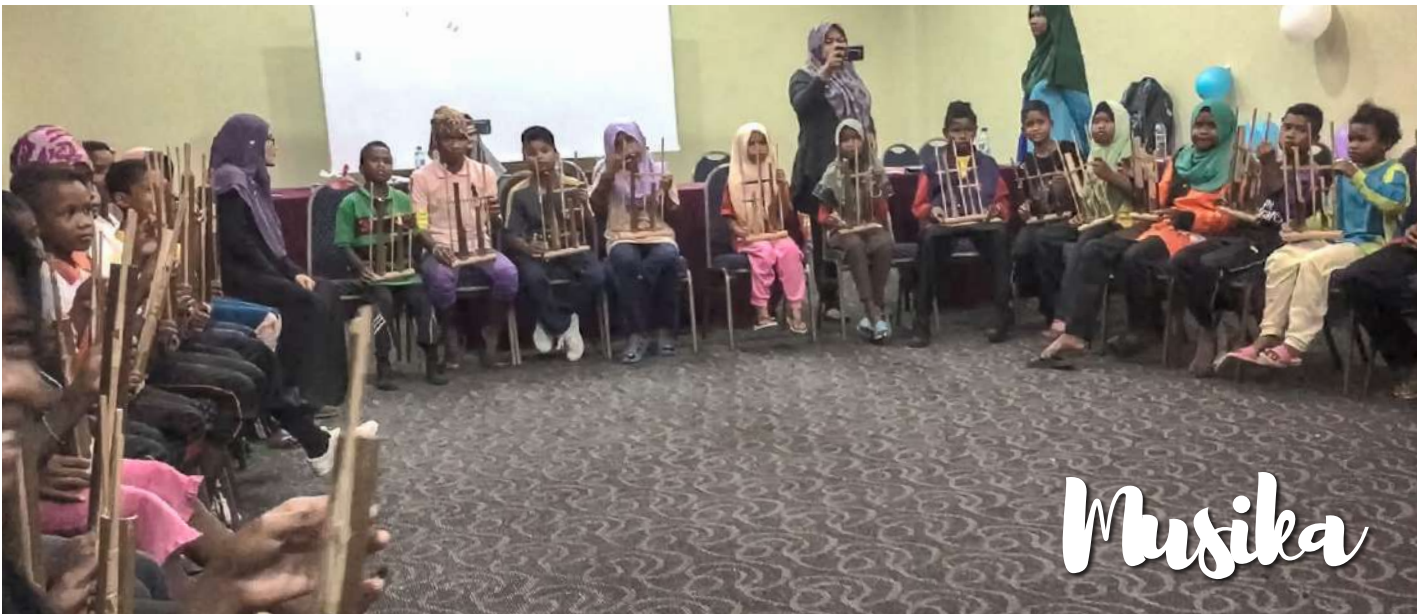
The participants closed this third series with Kun Anta's chord, a song by Humood Alkhudher. Para peserta menutup program siri ketiga ini dengan alunan lagu Kun Anta nyanyian Humood Alkhudher.