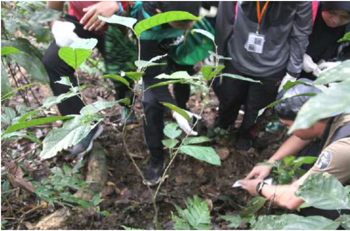
Young scientist at work - Collecting samples, reviewing of the data and finally recording the findings. Saintis muda - mengumpul sampel, menganalisa sampel dan akhirnya mencatat dapatan kajian.