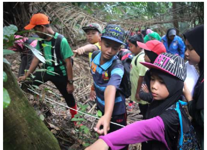
Peserta SK Felda Lawin mengambil bahagian dalam kem Green Ranger Malaysia (GRM).