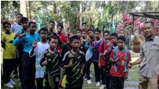
Para pelajar melawat Belum Discovery Centre dan Galeri Banding.