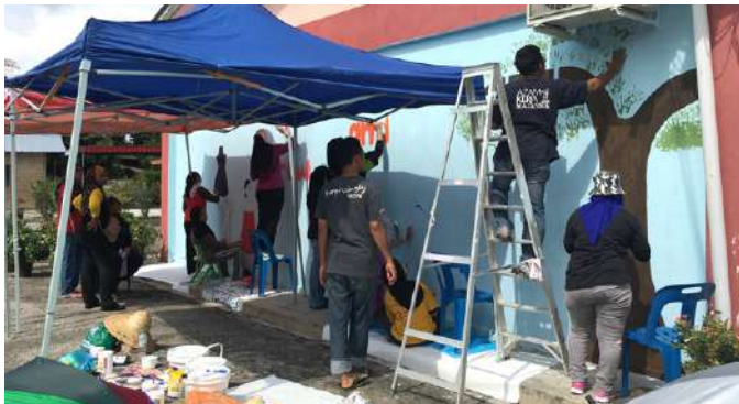
Terima kasih diucapkan kepada sukarelawan Kolej Vokasional ERT Setapak.