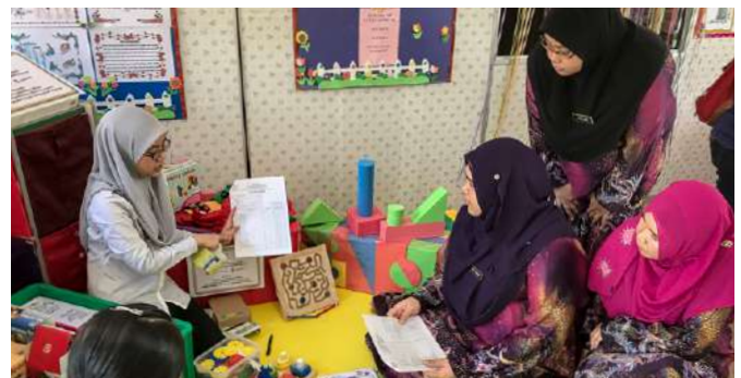
Kakitangan Yayasan EMKAY memberi taklimat penggunaan kotak-kotak permainan kepada guru-guru PKPI SMK Pengkalan Aur.