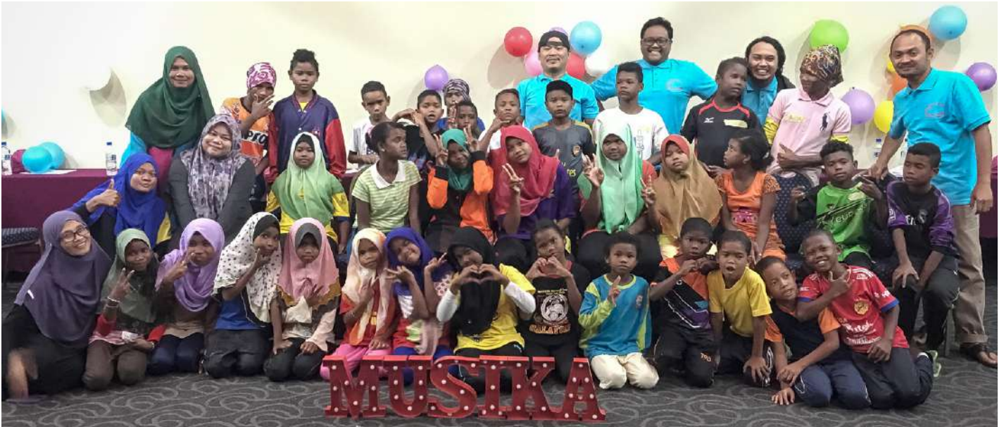
Group photo with the MUSIKA team. Gambar bersama Kumpulan MUSIKA.