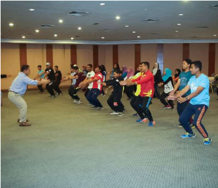
Warming-up session. Sesi memanaskan badan.