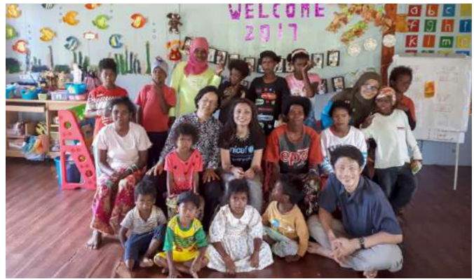
Delegasi bersama kanak-kanak PPip Sungai Kejar.

Harapan Yayasan EMKAY, dengan adanya pendedahan di pusat-pusat ilmu yang berhampiran dengan sekolah ini akan menimbulkan minat para pelajar untuk terus belajar dan meluaskan pandangan mereka tentang kerjaya di masa akan datang. Program lawatan yang dijayakan oleh Pulau Banding Foundation, Belum Rainforest Resort dan Yayasan EMKAY ini akan diteruskan di masa akan datang agar pendedahan sama dapat diberikan kepada semua pelajar SK RPS Banun.