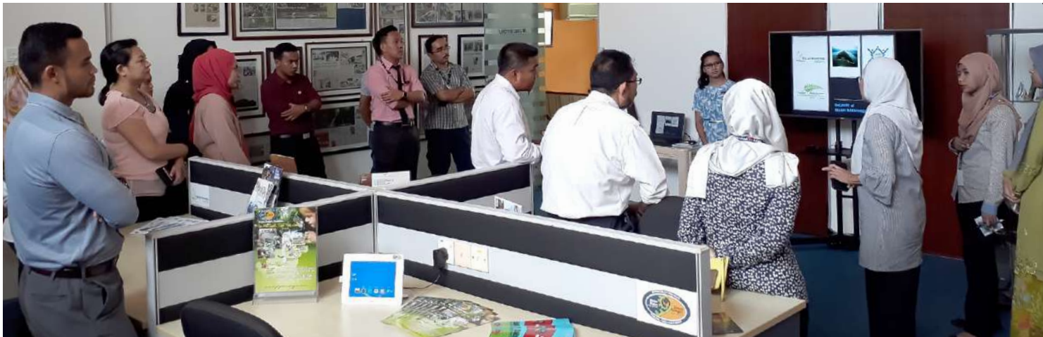
New staff of EMKAY and M K Land Groups being briefed on the Foundations' activities. Taklimat tentang kegiatan ketiga-tiga Yayasan diberikan kepada kakitangan baru dari Kumpulan EMKAY dan M K Land.