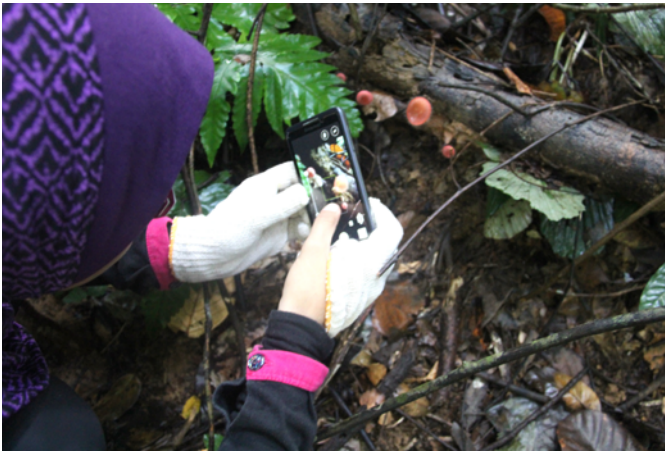
Nature photography. Sesi fotografi alam semula jadi.

oleh setiap peringkat peserta. Sehingga kini, lebih dari 2,000 orang peserta dari lebih 111 buah sekolah dan institusi telah menyertai kem Green Ranger Malaysia. Rata-rata para peserta telah memberi petunjuk bahawa kem sebegini yang memberi ilmu mengenai alam sekitar adalah amat berguna kepada kanak-kanak dan golongan muda.