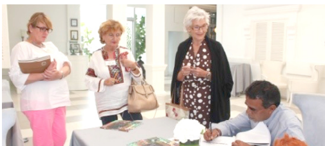
Author's biography session Sesi menandatangani oleh penulis.