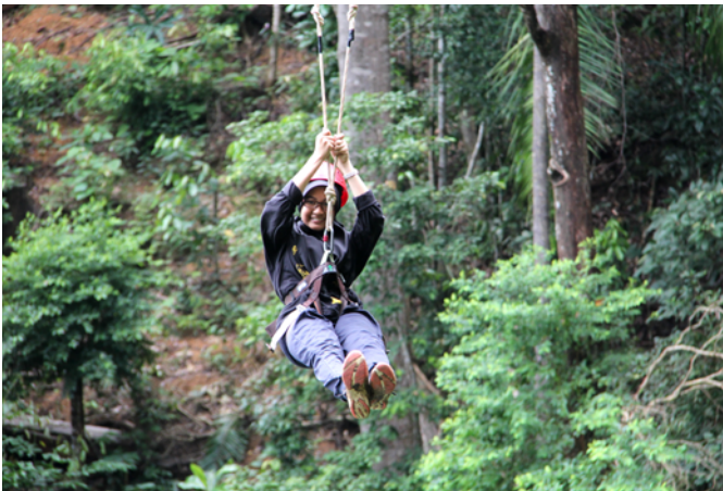
Jungle Flying Fox. 'Flying Fox' meredah hutan.