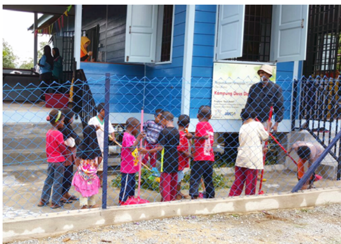
Toy Library children helping out during the 'gotong-royong'. Anak-anak PPip membantu sesi gotong royong.

Yayasan EMKAY dan Jabatan Tenaga Kerja turut menyumbang makanan kepada penduduk kampung yang sama-sama bertungkus-lumus dalam proses gotong-royong. Kanak-kanak di Desa Damai ini teramat teruja untuk meneruskan pembelajaran mereka di bangunan baharu ini. Justeru itu, kelas pertama di bangunan baharu ini dimulakan sehari selepas proses gotong-royong dijalankan.