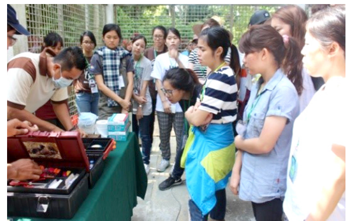
Live demonstration at the workshop.

Demonstrasi langsung semasa bengkel dijalankan.