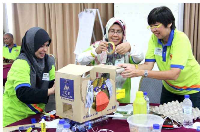
The teachers working hard on their creations with recycled items, one of the activities held during the conference. Para guru sedang tekun menyiapkan ciptaan mereka yang berasaskan bahan terpakai, salah satu aktiviti yang dijalankan semasa persidangan.