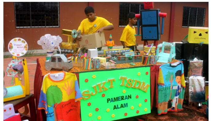
Nature themed exhibition. Pameran alam.