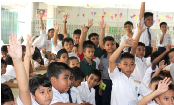
Students actively involved in question and answer session with marketing team of BMOUIF.

Para pelajar dan guru dari Penang Free School bersama kakitangan pemasaran OUIF.