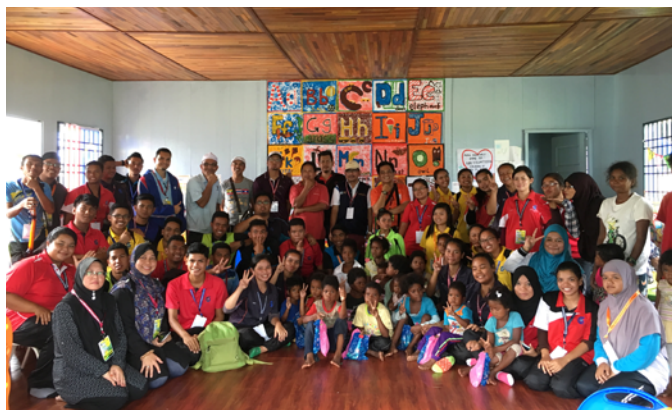
The participants and lecturers of IPGKTAA with the indigenous children of Kg. Sg. Kejar.

Di akhir program, siswa pendidik menyampaikan ucapan terima kasih atas penganjuran program ini yang mana berjaya memberikan mereka pengetahuan dan pengalaman yang sangat bermakna. Siswa pendidik peribumi dalam pada masa sama menyedari kepentingan pendidikan kepada masyarakat Orang Asli dan berjanji untuk menimba lebih banyak ilmu serta meningkatkan nilai-nilai sendiri yang positif sebagai seorang bakal pendidik masyarakat Orang Asli.