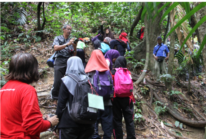
Jungle trekking activity. Aktiviti menjelajah hutan.