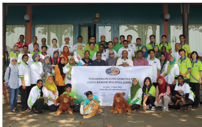
A group photo of the teachers and the trainers. Gambar berkumpulan para guru bersama pelatih.

Beliau menyeru agar guru-guru memainkan peranan yang aktif di dalam membangunkan GRM di sekolah masing-masing, apatah lagi dengan adanya sokongan dari NGO seperti Yayasan EMKAY dan Pulau Banding Foundation, serta konsultan yang menjalankan kem-kem GRM. Beliau juga berkata GRM merupakan modul pendidikan yang komprehensif, seimbang (merangkumi akademik dan bukan akademik) dan bersifat menyeluruh (holistik). Lanya juga menjurus kepada kemenjadian pelajar, berasaskan pengajaran dan pembelajaran yang berpengetahuan, kemahiran berbahasa, kemahiran berfikir aras tinggi, beretika, beridentiti nasional dan mudah diikuti sepanjang masa.