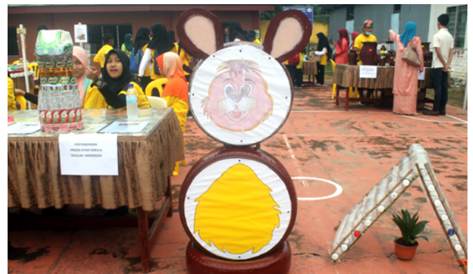
Invention competition. Pertandingan rekaipata.

Tuan rumah kem dan karnival ini, iaitu SMK Sungkai telah berjaya merangkul tempat kedua dalam pertandingan taman mini yang juga telah dirasmikan pada 24 Oktober 2015.