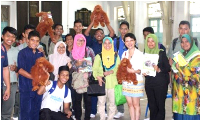
Students and teachers from Penang Free School together with BMOUIF marketing team.

Pameran bergerak yang berbentuk pendidikan ini telah mendapat sambutan yang amat baik dari kumpulan sasaran. Kakitangan pemasaran OUIF juga telah mengadakan pameran bergerak di sekolah-sekolah SJK (C) Aik Hua, Penang Free School, Penang Chinese Girls School, Methodist Girls School Primary, ST Xavier 1 dan SJK (T) Azad Penang.