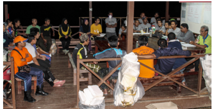
Night briefing and discussion. Sesi taklimat dan sesi perbincangan pada waktu malam.