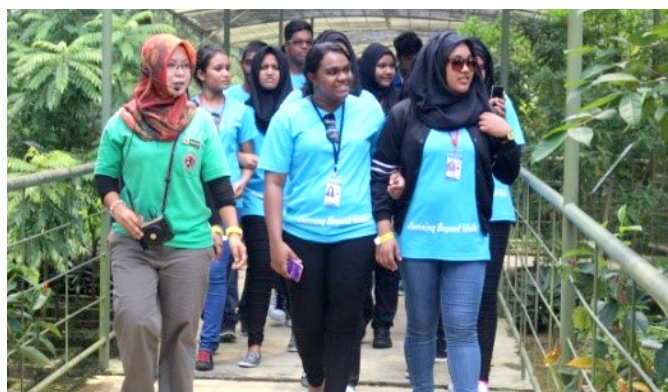
Guest Service Officer briefing the Maldives students at the tunnel regarding the conservation of orangutan during the tour. Kakitangan OUI memberi taklimat kepada para pelajar tentang konservasi orangutan semasa lawatan.