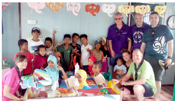
Group photo with the Commissioner of UK Scouts at 'i-play' Toy Library @ Kg. Desa Damai.

Gambar berkumpul bersama Pesuruhjaya Pengakap UK di PPip @ Kg. Desa Damai.