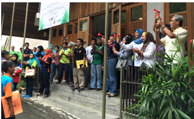
The flagging off of participants by the guests of honour and GRM committee members after the opening ceremony.