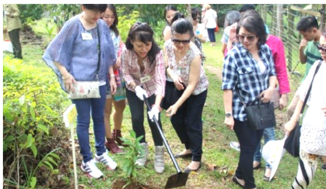
Members of (IWA) participating in the tree planting. Para pelawat mengambil bahagian dalam aktiviti penanaman pokok.