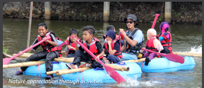
Nature appreciation through activities.

The 4th Royal Belum Scientific Expedition was held from the 7 th -17 th of September 2015. Organised by PBF, the expedition consisted of research teams from renowned Malaysian universities and research institutes. The expedition was to document new inventories of flora and fauna in and around the Sg. Kejar and Sg. Tiang Basin located in the Royal Belum Rainforest.