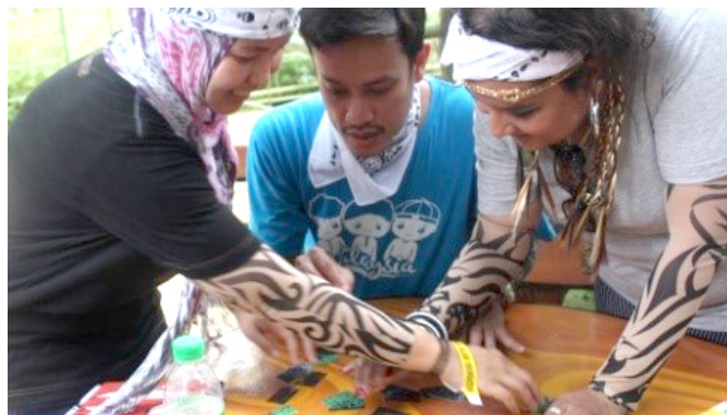
Staff of Destination Perak engaged in conservation and team building activities. Kakitangan Destination Perak semasa aktiviti konservasi dan aktiviti 'team building'.

Program kesedaran untuk badan korporat yang pertama telah diadakan pada 11hb September 2015 untuk kumpulan dari Destinasi Perak. Program separuh hari ini memuatkan pelbagai aktiviti konservasi dan sesi taklimat. Seramai 35 kakitangan dari organisasi tersebut telah mengambil bahagian dalam program ini.