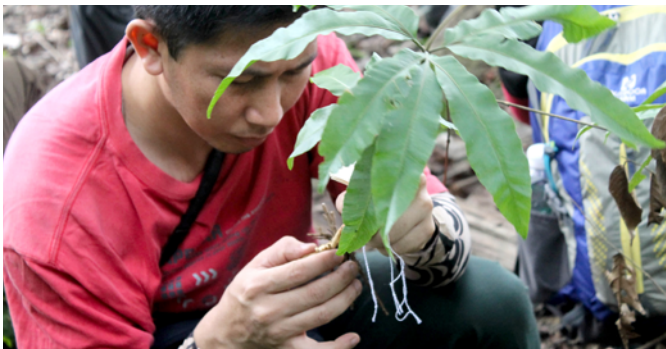
Tagging of new flowering plant. Menanda tumbuhan berbunga baru.