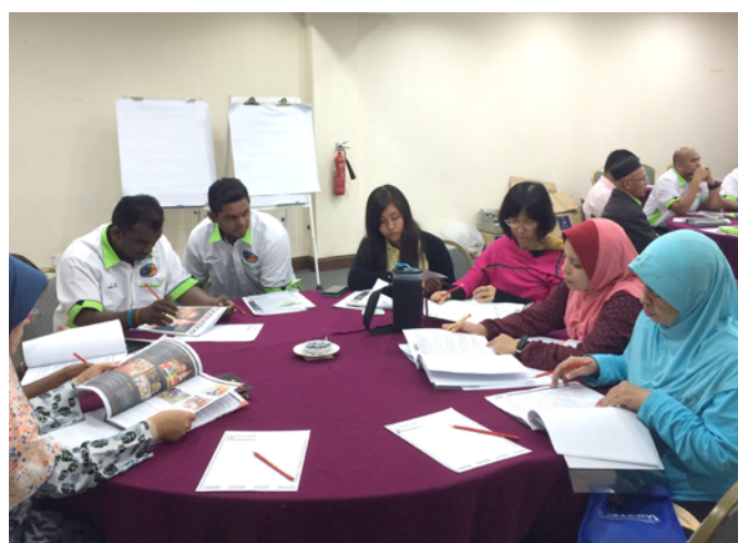
Exchange of ideas and discussion session. Sesi bertukar pendapat dan perbincangan.