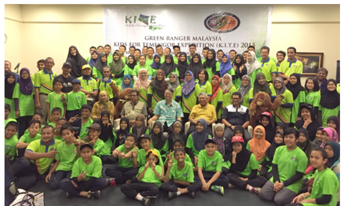
KITE 2015 participants.