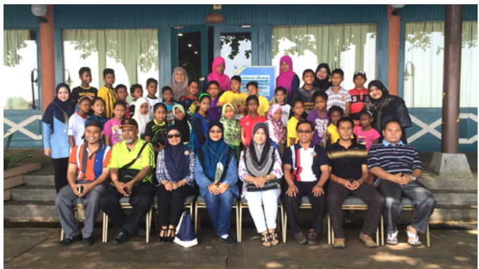
'i-play' Toy Library young volunteer's training camp group photo.

Wajah ceria peserta sejurus selesai penyediaan menu masing-masing bagi aktiviti "Prepare to Serve".