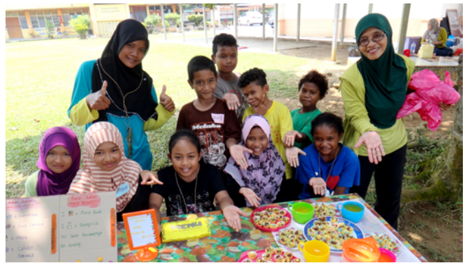
The happy faces of the participants after preparing their menu for the "Prepare to Serve" activity.

Murid-murid Orang Asli serta guru-guru pengiring dan sukarelawan/perantis Perpustakaan Permainan 'i-play' telah memperoleh manfaat dari aspek pengetahuan akademik, fizikal dan insaniah melalui pengisian serta aktiviti interaktif termasuk sesi lawatan ke Perpustakaan Permainan 'i-play' di SK Kampung Selamat dan lawatan ke Pulau Orang Utan.