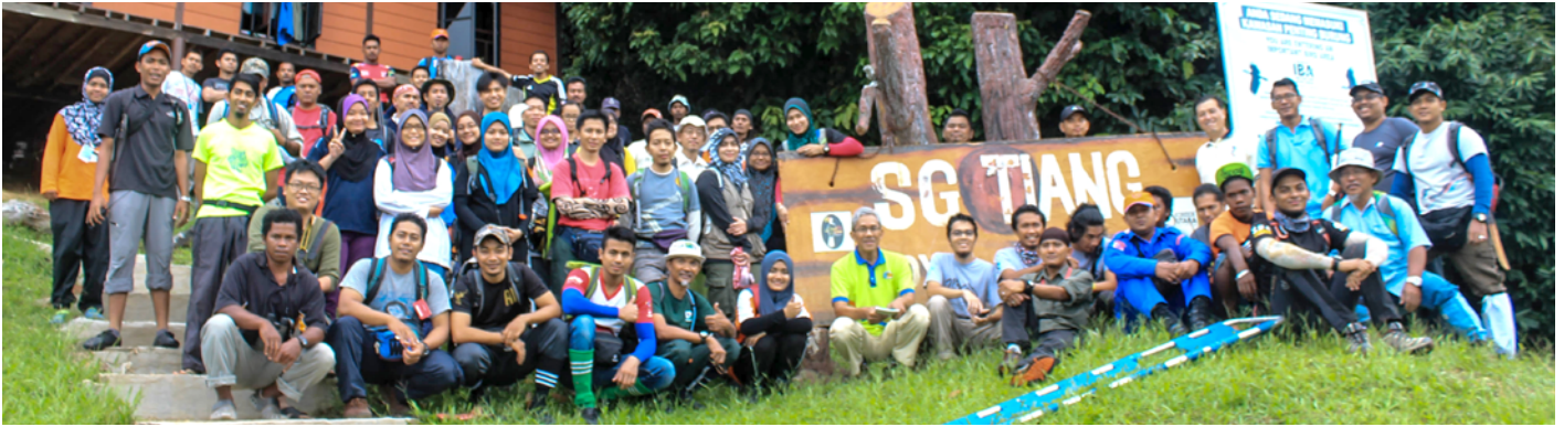
Expedition team at the Sg. Tiang Base Camp | Kumpulan ekspedisi di Kem Pangkalan Sg. Tiang.