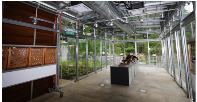
The interior and exterior of BDC. Persekitaran BDC.